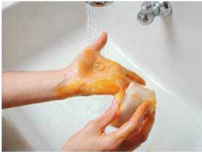
Homes and Businesses