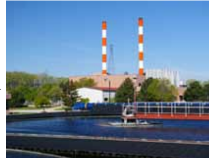
Wastewater Treatment Plant